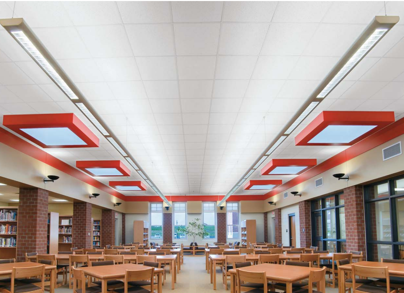
FINE FISSURED Square Edge with PeakForm Prelude XL 24mm Exposed Tee grid